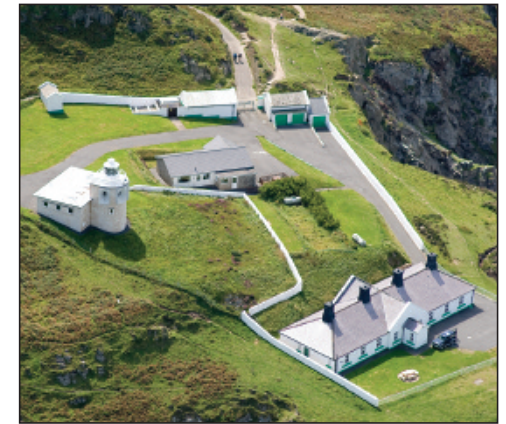
Near Morthoe, the lighthouse at Bull Point.