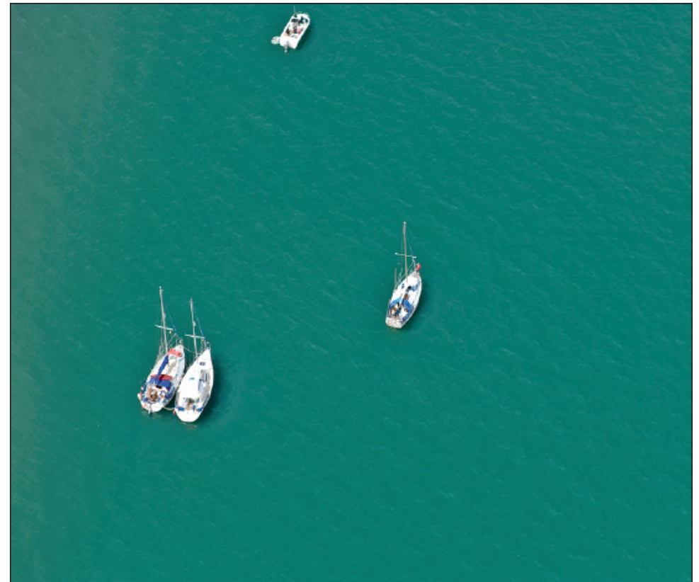
Blue Lagoon. Yachts moored off Clovelly.