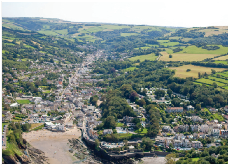
Combe Martin boasts the longest main street of any village in Britain, being two miles in length.